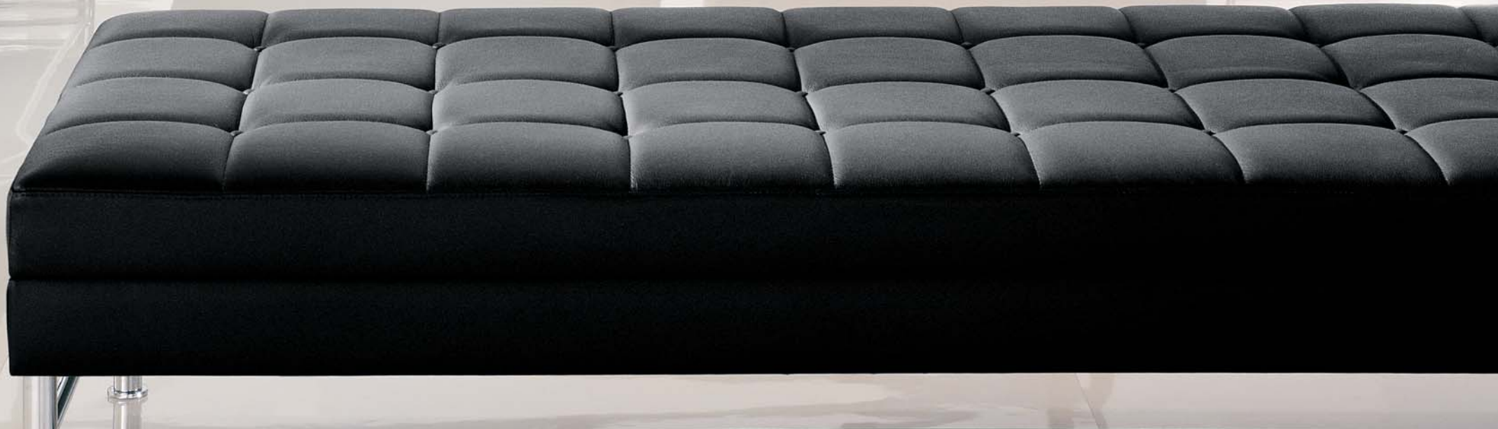
MODELS SHOWN: Aegis chair / Chair with side table / Bench / Bench with bolster.