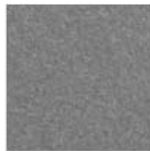
MGP Platinum grey