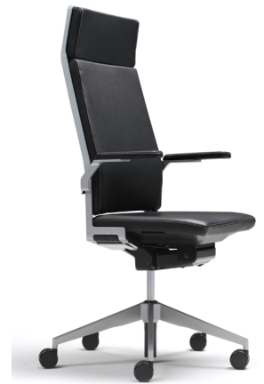
Backrest with headrest

Permanent contact, locking seat back with anti-return system. 5 locking positions.