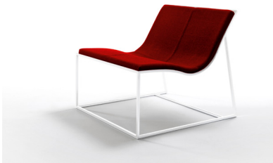
HOLY DAY armchair