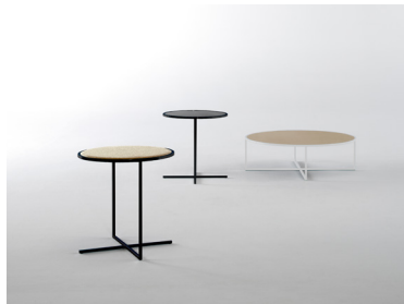
HOLY DAY table