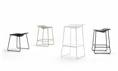
LAST MINUTE stool bar